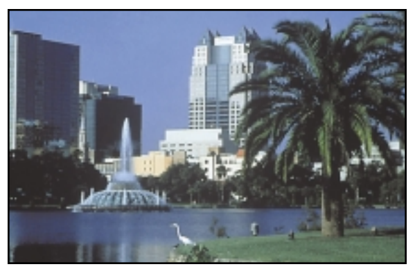
Orlando's downtown skyline from Lake Eola.

For subscription service and information on our Online Archive, visit the JCO booth (No. 325) at the AAO meeting. For information before the meeting, call us at (303) 443-1720.