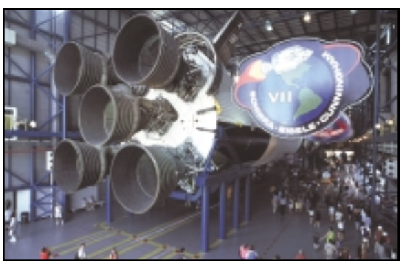
Display at Kennedy Space Center Visitor Complex.

Museums abound in Orange County, led by the Orlando Museum of Art, with a show by glass master Dale Chihuly running through May 30. The Orlando Science Center features an interactive exhibit on experimental aircraft.