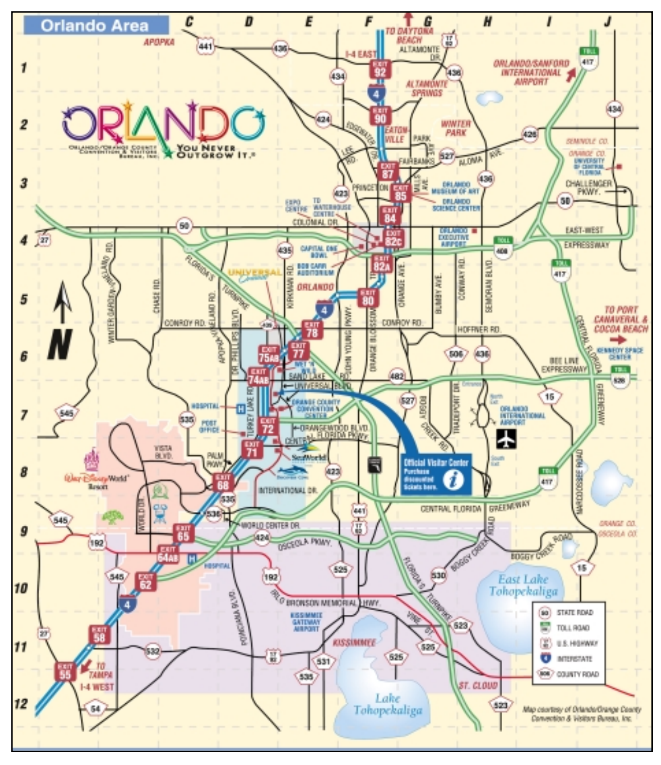
Map and photographs courtesy of Orlando/Orange County Convention & Visitors Bureau, Inc. SeaWorld photograph courtesy of SeaWorld Adventure Park.