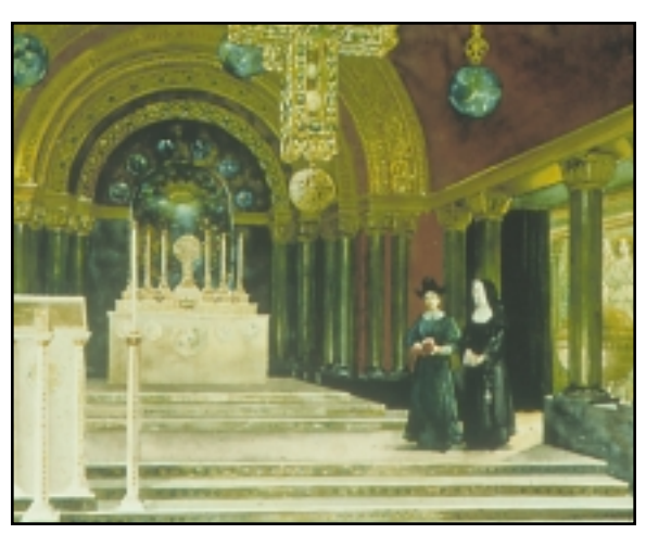
Tiffany Chapel in Charles Hosmer Morse Museum.

For more specialized tastes, the Charles Hosmer Morse Museum of American Art in Winter Park has the world's most extensive collection of pieces by Louis Comfort Tiffany; the Zora Neale Hurston National Museum of Fine Arts in Eatonville showcases African-American art; the Mennello Museum of American Folk Art spotlights self-taught artists; the Flying Tigers Warbird Restoration Museum in Kissimmee offers vintage aircraft; the Grand Army of the Republic Memorial Hall in St. Cloud explores the Civil War era; and the Water Ski Hall of Fame in Polk City and the Hard Rock Cafe house museums on their respective subject areas. The Salvador Dalí Museum in nearby St. Petersburg celebrates its namesake's centennial this year.